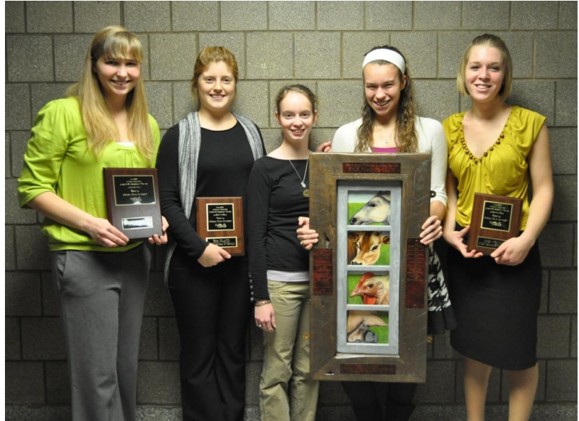
The winning undergraduate team from University of Wisconsin