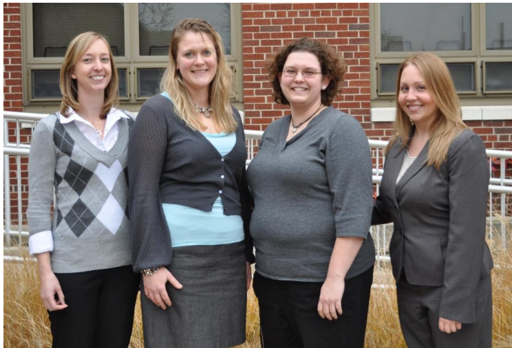
The winning graduate team from MSU