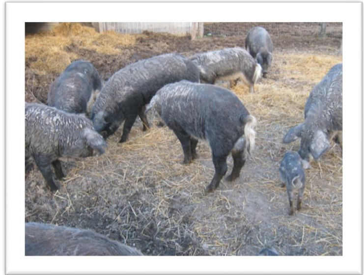
Photos from the National Park Neusiedler See excursion.