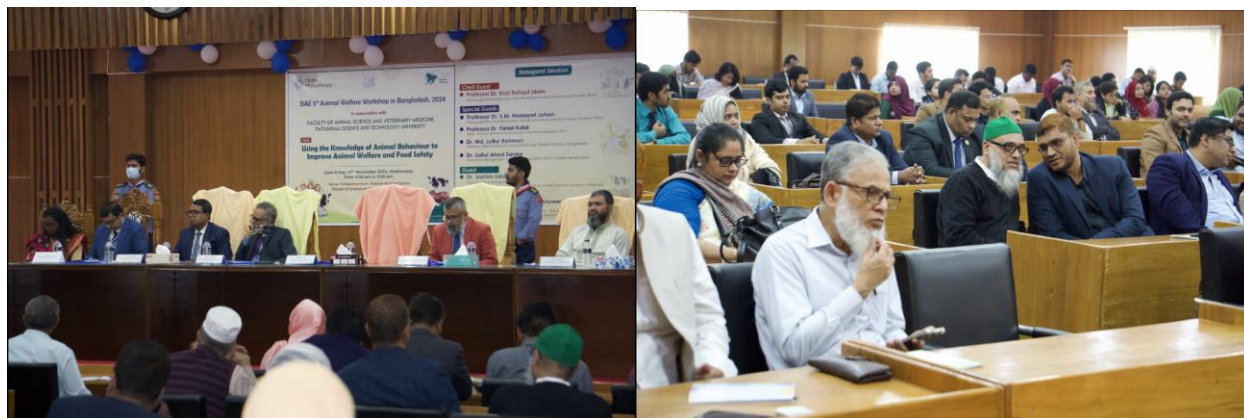
Photos from Bangladesh workshop