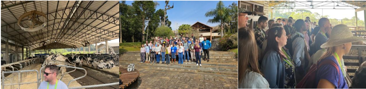
Photos from ISAE DCCAF 2024