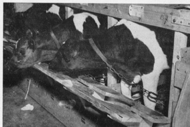
"Farmer & Stockbreeder" photograph.