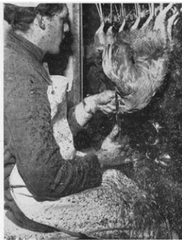
The slaughterman cutting the neck of a live bird. Photograph taken in 1959.

The only hope for the future rests with YOU, the individual! Take action with us NOW! See overleaf.